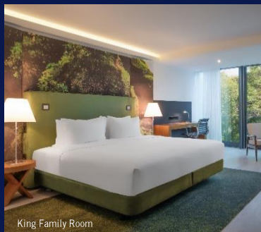
King Family Room